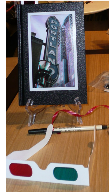
Dean Walch, an anaglyphic photographer, included 3D photos, glasses, and a marker for special 3D pages inside.