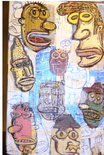
Artist Gary Hirsch painted characters on both covers and included "bonus" mini paintings with dossiers inside.